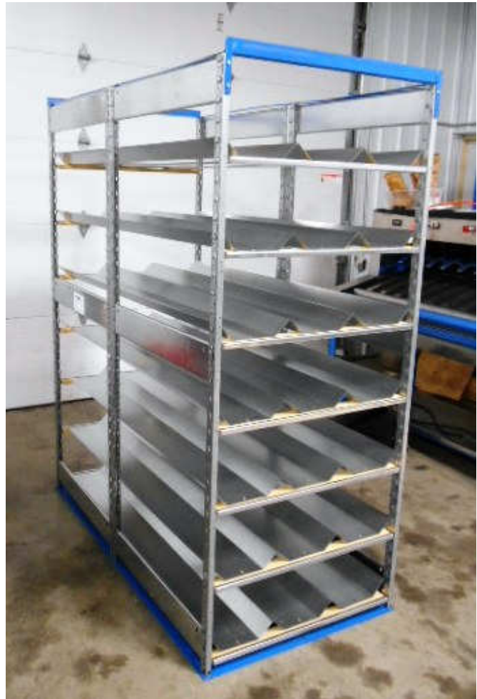
Oversize Stacks Anchor Section

The trays are 58 inches deep which provides adequate length for your 5 foot and 6 foot wide mats. The trays are adjustable every 2 inches as well.