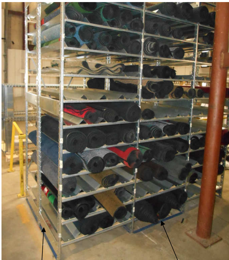
Add On Section W/Base